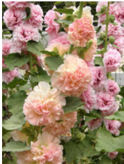
Pom Pom Hollyhocks: "Apricot-Peach Parfait" ( Alcea rosea )

A special variety whose starry 2 inch blossoms are beautifully splashed with showy contrasting colors. Their delicious jasmine fragrance floats on summer breezes. Easy to grow and reliable.