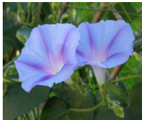
Morning Glory: "Dawn Star" ( Ipomoea tricolor )

Exclusive: Beautiful new double hollyhocks in luscious colors. Sturdy tall 5 to 7 foot stalks are packed with powder puff blossoms that unfurl in delicious shades of apricot and rosy-peach.