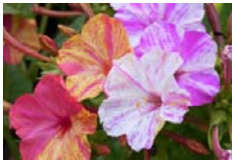
Four O'Clocks: "Broken Colors" ( Mirabilis jalapa )

Satiny blossoms in entrancing Valentine shades to light up the spring garden. Includes singles and doubles in glowing crimson, rose-red, white rimmed rose and the occasional peach, many with picotee petals.