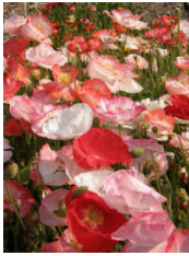
Shirley Poppies: "Falling In Love" ( Papaver rhoeas )

Satiny blossoms in entrancing Valentine shades to light up the spring garden. Includes singles and doubles in glowing crimson, rose-red, white rimmed rose and the occasional peach, many with picotee petals.